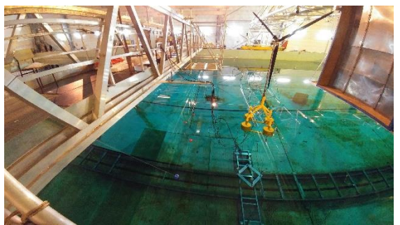
Fig. 2: Ocean Basin at ECN with the 1:50 scale model

In October 2017 a scaled model (1:50) of the new substructure design and a respective 6 MW turbine has been successfully subjected to wind and wave loads at the Ocean Engineering Tank of the Ecolé Central Nantes (ECN).